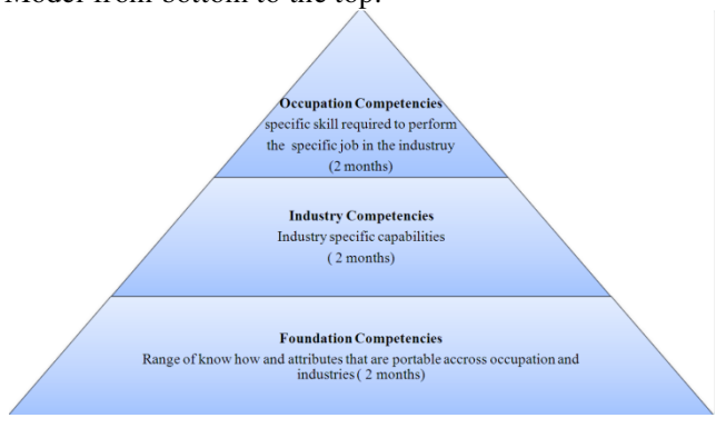
Figure 4: Proposed Employability Model for University Gradautes

In view of the critical state of unemployment and resource constraints of the country, the author s has developed an Employability Model for the university graduate students. This model is developed by refering the Employability Models of the two countries ie. Malaysia and Singapore. The study understands that this Model of Employability could be able to reduce the unemployment amongst the university graduate student. The study has explored following model for the employability of university graduates. The following figure demonstrates the three steps of Employability Model from bottom to the top.