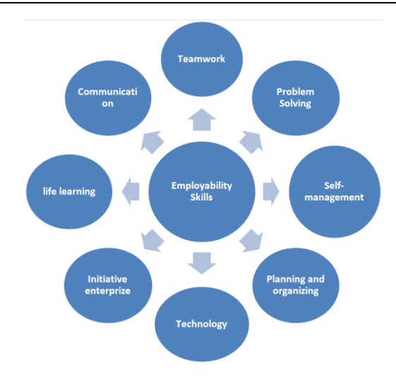
Figure 1: Australian Employability skills Model

Australian universities work to develop employability skills in their students by providing academic staff with relevant support and resources, integrating these skills into curriculum and course design. They are providing students with work placements and exposure to professional settings and providing advice and guidance through career services. Furthermore, universities offer students opportunities to develop themselves through participation in clubs and societies and university life. Most of the students are concurrently developing these skills through part-time employment, volunteer work and community participation ((CWA, 2007). The following framework present above indentified eight employability skills.