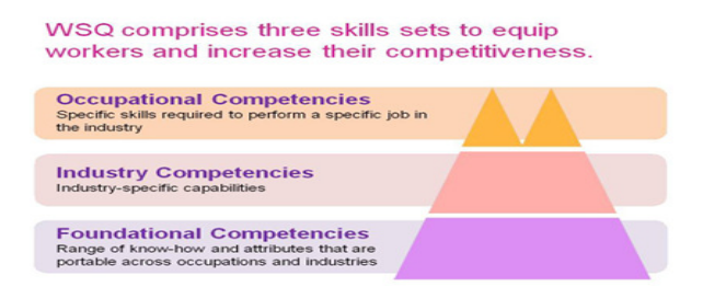
Figure 3 : Singaporean Employability Model

The Singaporean Government has introduced a graduate employability scheme that based on Workforce Skills Oualification System (WSO). The Singaporean workforce skills qualification (WSQ) is a national credentialing system. It train, develop, assess and recognize individuals for competencies, they are looking for. This system is based on national standard developed by Workforce Development Authority in collaboration with the various industries. The Workforce Skill Qualification comprises industry sectoral framework, which serves professionalize the industry, enhance labor market flexibility and skills portability in growing industry with high demand of skilled workers and professionals. All Skills are recognized by the respective industries for enhancing the competitiveness of Singaporean workforce (WDA, 2011).