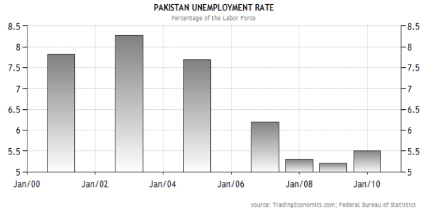
Graph-1 : Yearly Unemployment Rate in Pakistan

In the December, 2009, the unemployment rate was reported at 5.50 percent. And from 1990-2009, the unemployment rate averaged at 8.27. The following chart shows the unemployment rate of Pakistan from 2000 to 2010 (FBS, 2012).